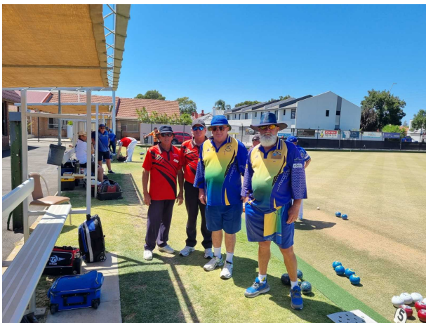
Very Positive comments received