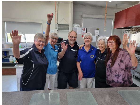
The always present reliable volunteers in the kitchen. New faces are required. Please consider volunteering to assist with these events.