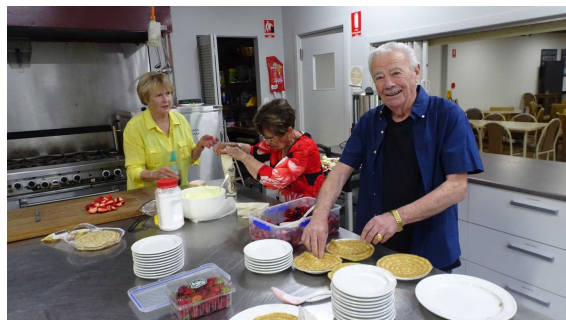
Croquet helpers preparing the dessert.