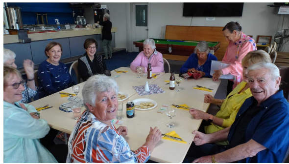
More Croquet members enjoying the evening