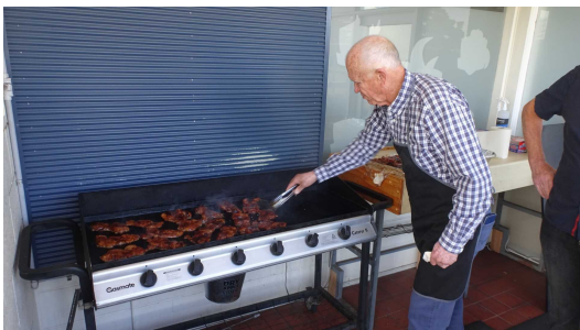
The BBQ Guru