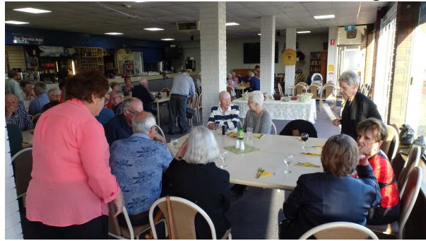
Croquet members ready for a great night