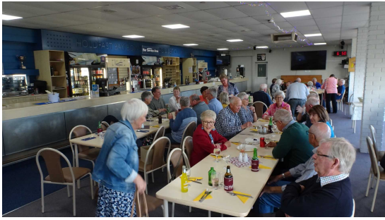
A great attendance